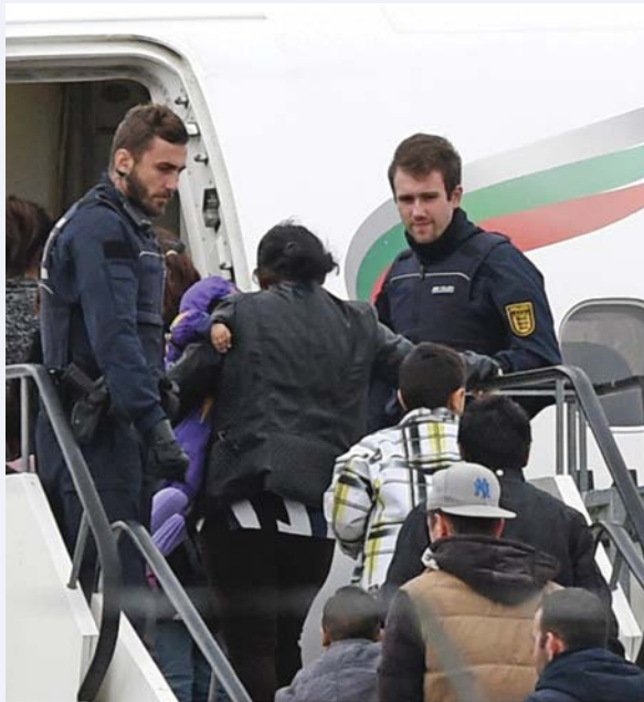
German police escort migrants from Kosovo onto an airplane at the Karlsruhe/Baden-Baden airport in November 2015 after their asylum claims were rejected.

of their geography and the fact that their economies are too fragile to incur the political and economic costs of dealing with large numbers of refugees and migrants. This point is made clear by the recognition that