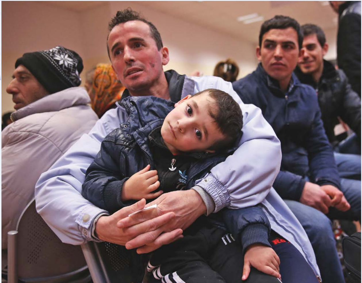
Albanian migrants wait to register at the central registration office for asylum seekers in Berlin in March 2015.

in 2015. The burden of accepting refugees has fallen disproportionately on a few Western European states. Germany and Sweden have accepted the majority of refugees, while other EU member states have been less welcoming. According to Eurostat data, there were almost 900,000 registered asylum seekers in the EU. Germany received the most, totaling almost 500,000 at the end of 2015.