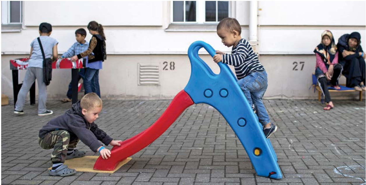
A Bosnian boy, left, plays with an Afghan boy in the courtyard of the former Wilmersdorf town hall in Berlin in August 2015. A large percentage of the refugee flow entering the European Union are from Western Balkan countries such as Bosnia and Herzegovina.

ranges from 17 to 35 percent. This makes the Western Balkans the last place to host refugees.