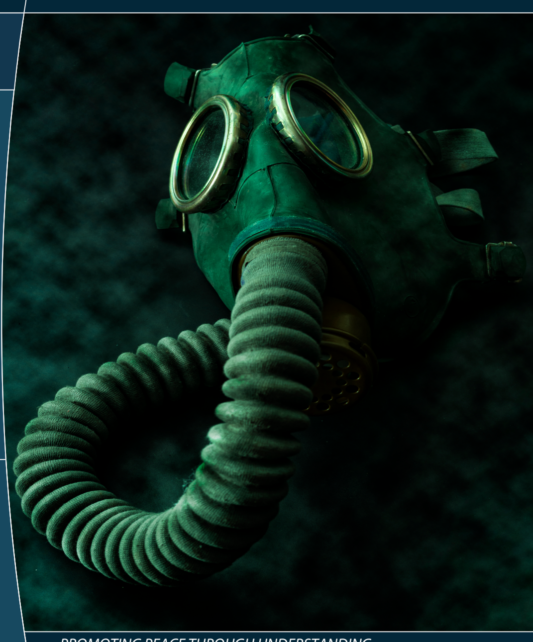
PROMOTING PEACE THROUGH UNDERSTANDING