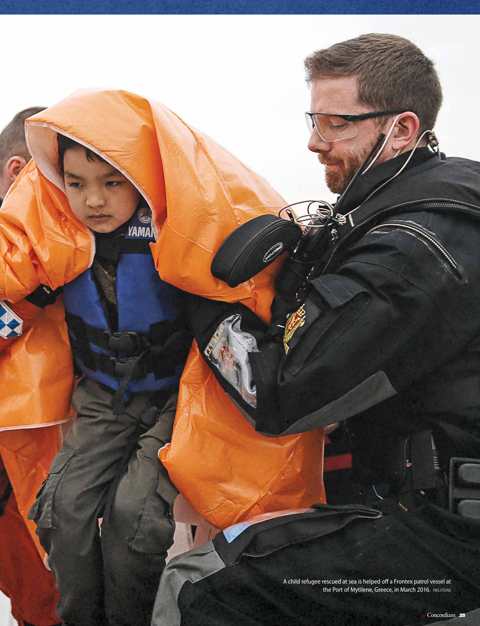
A child refugee rescued at sea is helped off a Frontex patrol vessel at the Port of Mytilene, Greece, in March 2016.