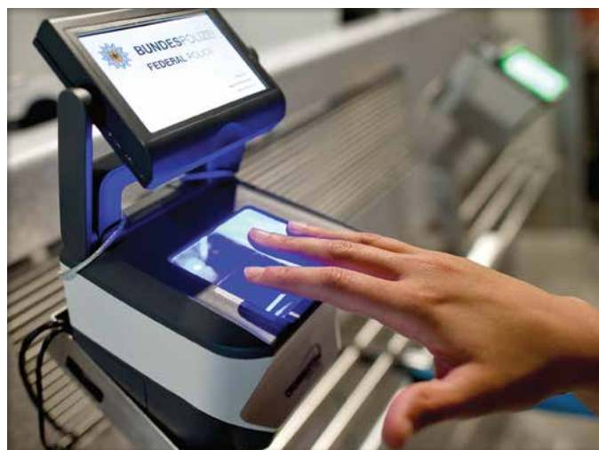
A female passenger scans her fingerprints as part of the Smart Border management system implemented at the airport in Frankfurt/Main, Germany, in June 2015. The EU Commission has launched a pilot project for checking non-EU citizens at the Frankfurt airport to help expedite border checks.

Irregular flows along the southern border of the EU are a concern for governments, particularly those in Mediterranean countries that have become major gateways into the bloc. Flows from North Africa, mostly originating in Sub-Saharan Africa but increasingly in the Middle East — as a consequence of the political and social instability of these regions — are mainly due to the growing imbalances between the two shores of the Mediterranean and instability in this region and nearby areas. The short distance between the opposing coastlines fuels migrant flows and contributes to making political, social and economic differences even more visible.