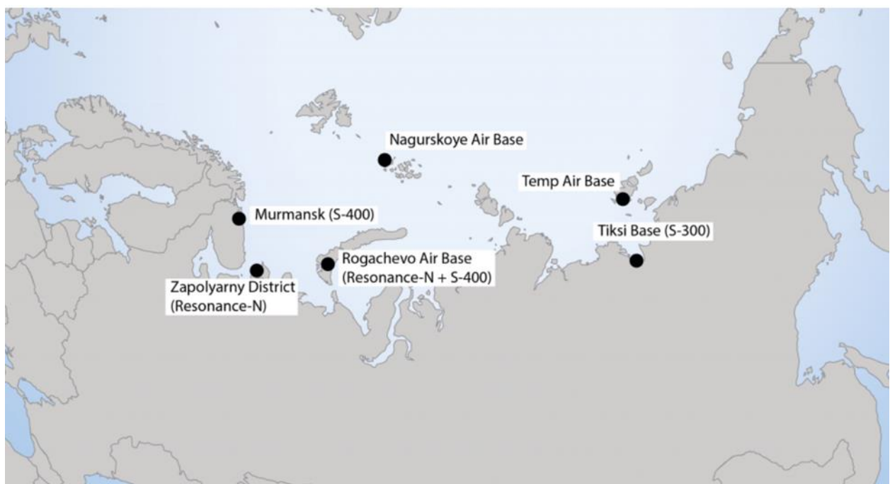
Figure 2: Select military bases with anti-aircraft missile systems and radar installations across the Russian Arctic. Source: Malte Humpert and High North News 2

Russian military capabilities are likely to continue to increase in the region, though they still remain far below Cold War levels. With a fraction of assets available when compared to Cold War era capabilities, Russia explains this increase in military forces as modernization and development of SAR capabilities. However, other states are taking note of the new capabilities in the region and their importance to strategic deterrence and national security.