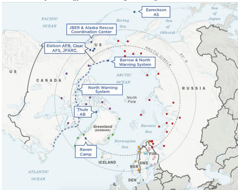
Figure 3. Sample of Arctic region military facilities.