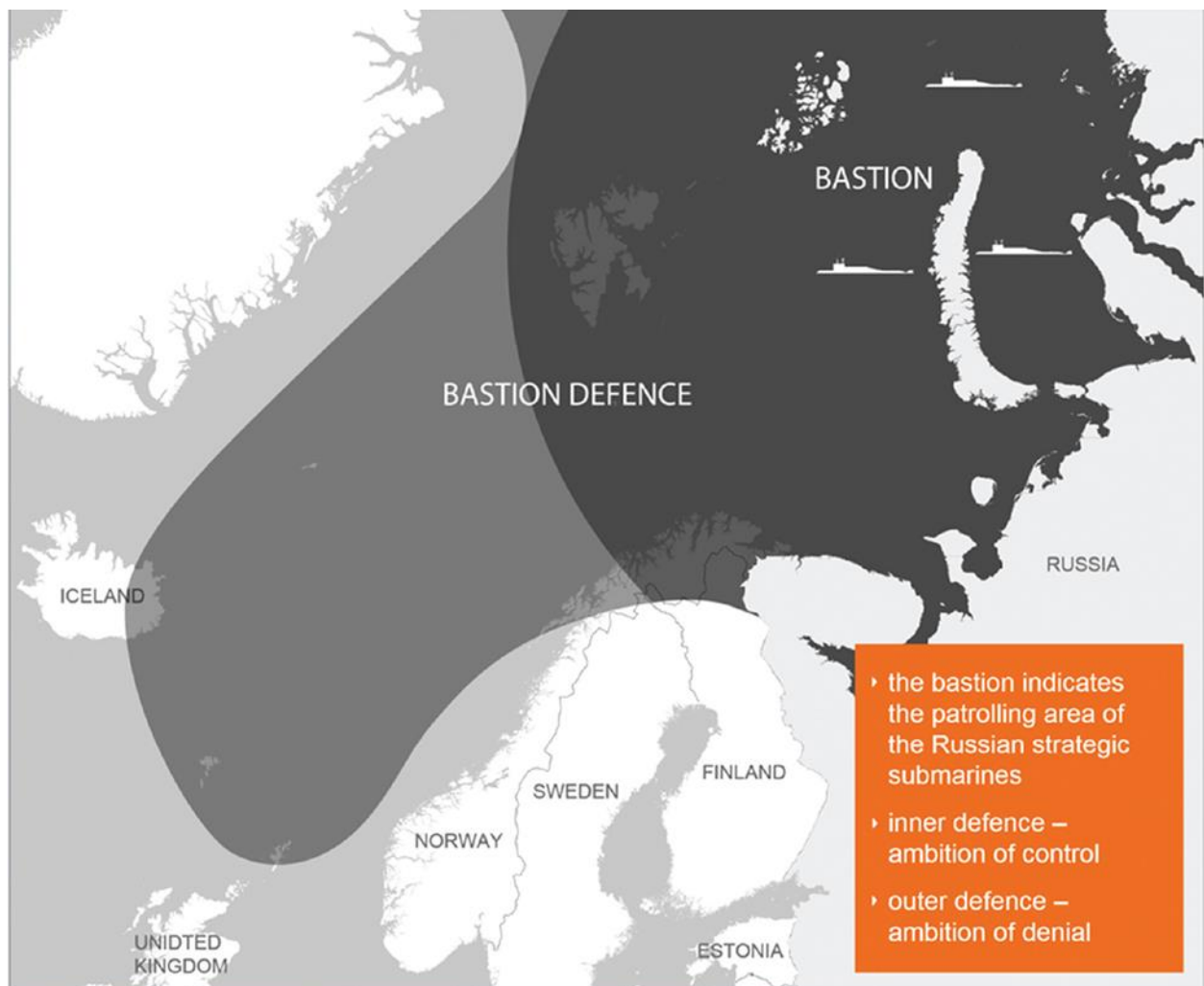
Figure 1: “The Russian Bastion” as depicted by the Expert Commission on Norwegian Security & Defense Policy 1

old Soviet bases, built new airfields and deep-water ports, and modernized their military forces in the region, bringing the share of modern weapons, military and special equipment in the Arctic Zone from 41% in 2014 to 59% in 2019, according to Russia’s 2020 Arctic strategy. Russia further established a Joint Arctic Strategic Command and, on January 1, 2021, upgraded the Northern Fleet to the status of a military district. The importance of protecting Russia’s SSBN bastion – which is the most survivable leg of their nuclear triad, enabling both deterrence and second-strike capability – is a critical role for the Northern Fleet.