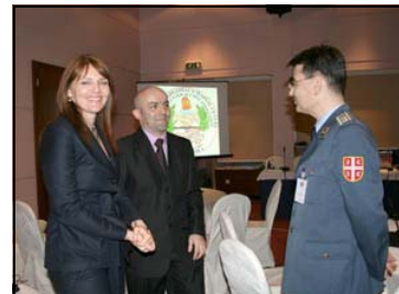
Alumni talk during a break.