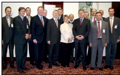
Senior Advisory Council members and observers met Feb. 12 in Freising to discuss the next fiscal year's programs.

The PfP Consortium's Senior Advisory Council (SAC) met Feb. 12 in Freising, Germany, to discuss the Consortium's budget and program for fiscal year 2009, publications themes for fiscal year 2010, the annual conference, and ways to increase the reach and resources of the Consortium.